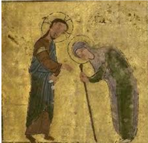
Jesus heals the crippled woman