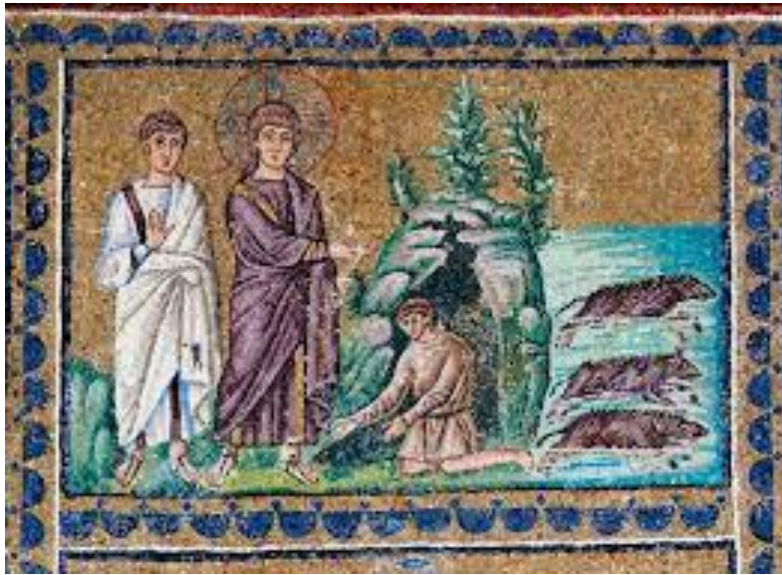
Exorcism of the Gerasene Demoniac