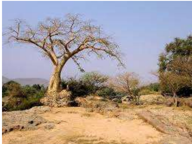
The barren fig tree - Sunday Mass Readings

The mass setting at this service is St Anne's Mass by MacMillan.