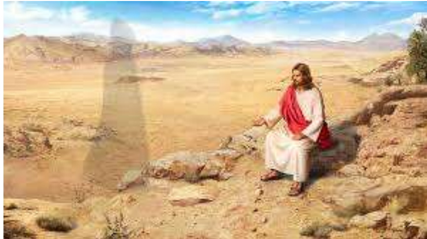
The Temptations of Jesus