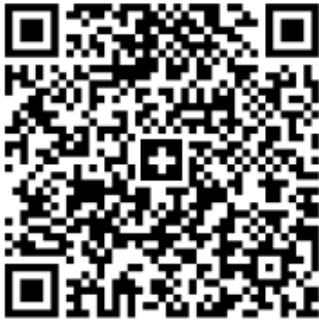
Swiss banking apps