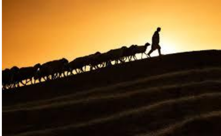
The Shepherd's Voice The Canadian Centre for Christian Charities