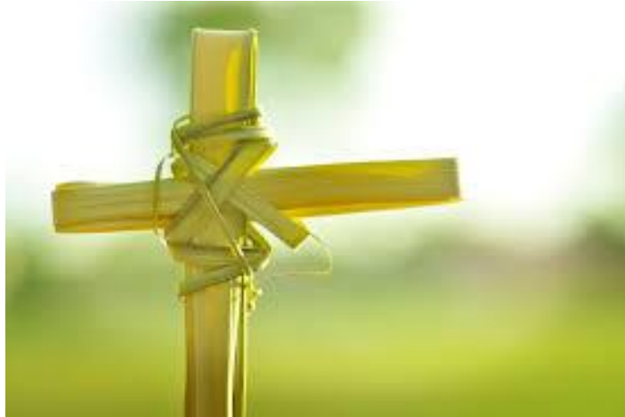
Palm Sunday (The pioneer woman)

The mass setting in this service is St Anne's Mass by MacMillan.